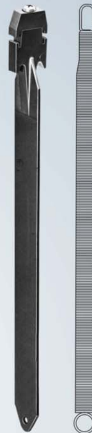
Leno Yoke Leno Spring

Leno Yoke & Leno Spring Can be offered in any other type, variety & size. Leno Selvage attachment, plastic Leno, complete Leno-attachments, cams for Sulzer, Ruti C weaving Machine can be offered as per requirements.